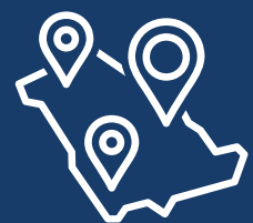
Regional Support Network