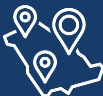
Regional Support Network