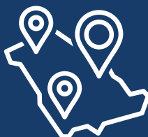
Regional Support Network