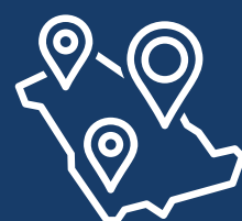
Regional Support Network