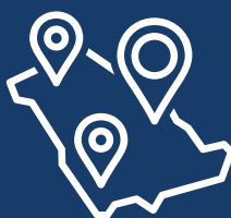
Regional Support Network