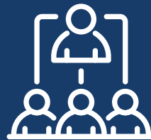
Registered Manager On-Site