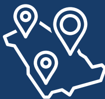
Regional Support Network